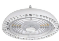
UHBS2 Metalux IP65