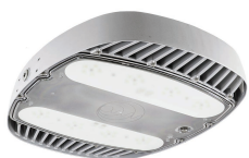
AR Series NemaLUX CID2 IP66 HZ