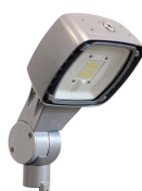
JR Series NemaLUX CID2 IP66/67 HZ