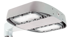
MR Series NemaLUX CID2 IP66/67 HZ