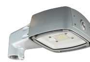
JR Series NemaLUX CID2 IP66/67 HZ