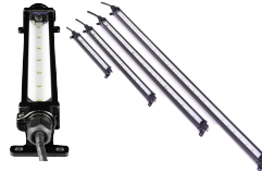
GS Series NemaLUX CID2 IP68 HZ