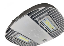
XR Series NemaLUX CID2 IP66 HZ