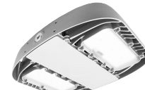
MR Series NemaLUX CID2 IP66/67 HZ