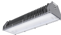
BL Series NemaLUX CID2 IP66 HZ