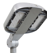
MR Series NemaLUX CID2 IP66/67 HZ