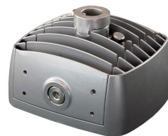
JR-CC ANTI-ROTATION CONDUIT CONNECTION