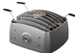
JR-SM SURFACE MOUNT