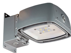
JR-WM2 WALL MOUNT 2