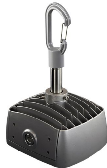
JR-HK HOOK PENDANT MOUNT