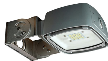
JR-YM YOKE MOUNT