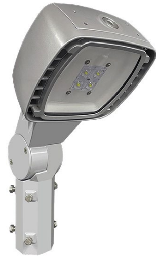
JR-SFY SLIP FITTER YOKE MOUNT