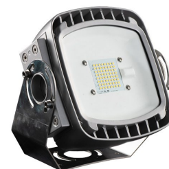
JR-YK HIGH VIBRATION YOKE MOUNT