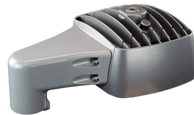
JR-PM POLE MOUNT